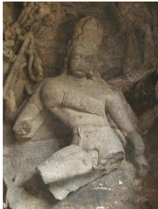
Shiva in the cave temple of Elephanta Island Near Mumbai