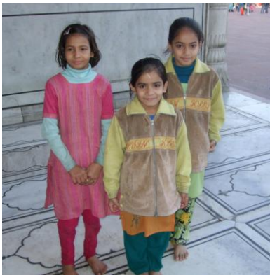
Children in New Delhi

The bottom line is that the population of India is young, dynamic, educated, and becoming upwardly