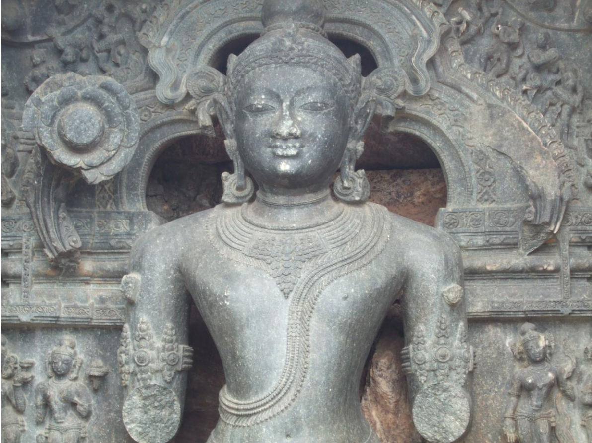
Depiction of Surya from the famous Sun Temple located near Konark, Orrissa